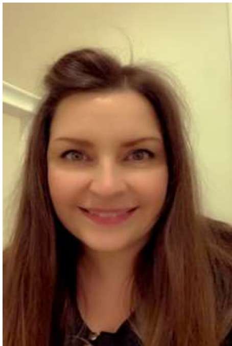
EYFS and KS1 Phase Director & Willow Class Teacher: