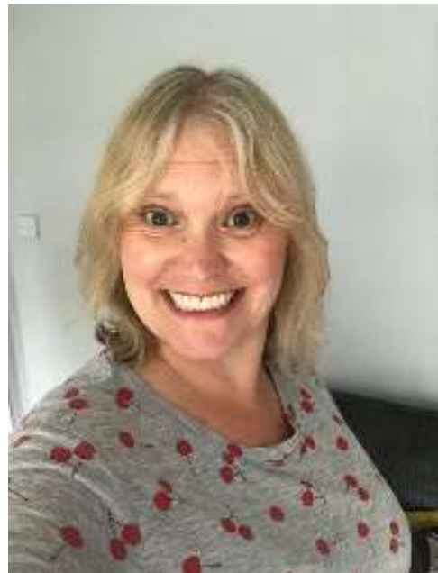
Willow Teaching Assistant: